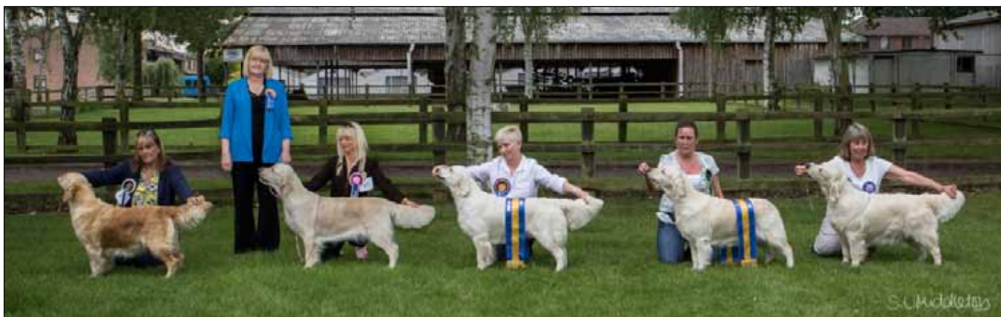
Bitches line up