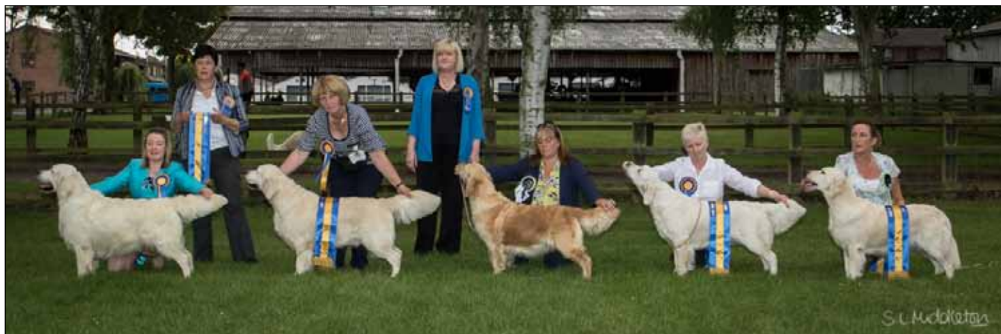
Joint Championship Show Best in Show line up (see report on page 8)