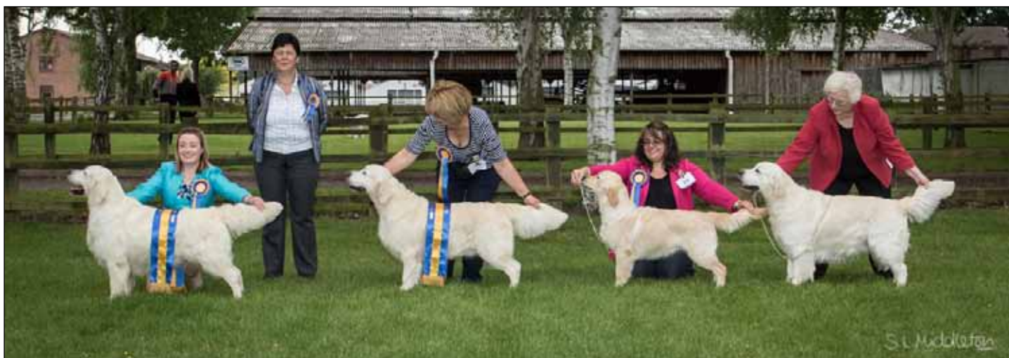
Dogs line up